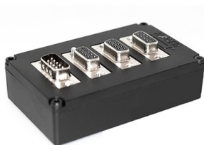
Kvaser T-Connector v2 EAN: 73-30130-00776-5