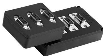
Kvaser T-Connector Expansion L EAN: 73-30130-01300-1