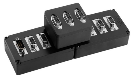
An eight D-SUB9 socket connector hub