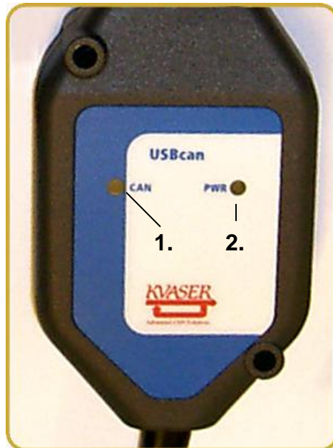
Figure 4. USBcan Rugged. LED configuration.