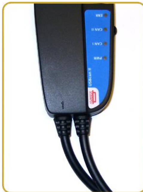
Figure 2. The channels on the USBcan II (channel 2 is not marked).