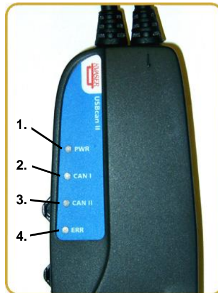
Figure 3. USBcan II LED configuration.

The LED's have somewhat different meaning on the different hardware. See Table 2 for USBcan II or Table 3 for USBcan Rugged.