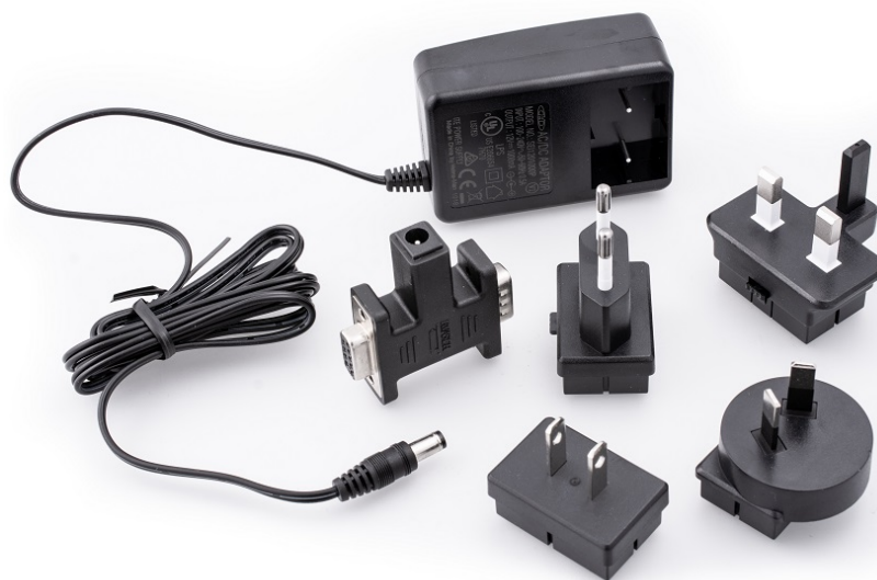
Figure 1: Kvaser DB9-Power Inlet

Kvaser DB9-Power Inlet is a power injector for CAN busses from a DC power jack into one female D-SUB9 connector. The Kvaser DB9-Power Inlet also has one unpowered male D-SUB9 connector for connecting to the CAN network. The Kvaser DB9-Power Inlet provides a simple and safe way to supply Kvaser bus powered interfaces with power, such as Kvaser's Blackbird and Memorator series.