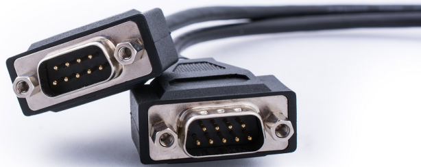
Figure 3: CAN/LIN connector on Kvaser Hybrid 2xCAN/LIN

The Kvaser Hybrid 2xCAN/LIN has two LIN/CAN Hi-Speed channels in two separate 9-pin D-SUB CAN connectors (see Figure 3). See Section 4.3, CAN/LIN connector, on Page 13 for pinout information.