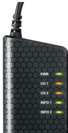
Figure 4: LEDs on the Kvaser Hybrid 2xCAN/LIN.