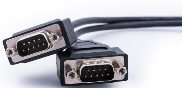
Figure 3: CAN/LIN connector on Kvaser Hybrid 2xCAN/LIN

The Kvaser Hybrid 2xCAN/LIN has two LIN/CAN channels in two separate 9-pin D-SUB CAN connectors (see Figure 3). See Section 4.3, CAN/LIN connector, on Page 13 for pinout information.