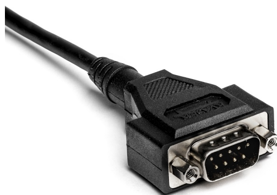
Figure 3: CAN/LIN connector on Kvaser Hybrid CAN/LIN

The Kvaser Hybrid CAN/LIN has one CAN/LIN channel in a 9-pin D-SUB CAN connector (see Figure 3). See Section 4.3, CAN/LIN connector, on Page 13 for pinout information.