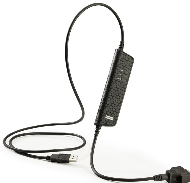
Figure 1: Kvaser Hybrid CAN/LIN

Kvaser Hybrid CAN/LIN is a single channel interface where the channel can be opened either as CAN or LIN. The Kvaser Hybrid CAN/LIN is compatible with applications that use Kvaser's CANlib and LINlib.