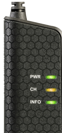
Figure 4: LEDs on the Kvaser Hybrid CAN/LIN.

Page 9. Their functions are described in Section 4.1, Definitions of LED states and colors, on Page 10.