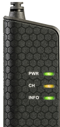
Figure 4: LEDs on the Kvaser Hybrid CAN/LIN.