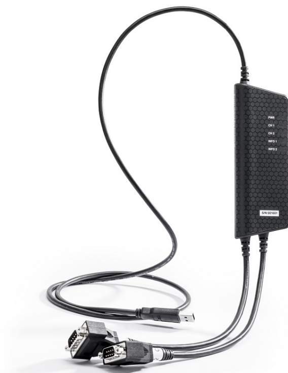
Figure 1: Kvaser Hybrid Pro 2xCAN/LIN

Kvaser Hybrid Pro 2xCAN/LIN is a two-channel interface where each channel can be opened independently either as CAN or LIN. The Kvaser Hybrid Pro 2xCAN/LIN is compatible with applications that use Kvaser's CANlib and LINlib.