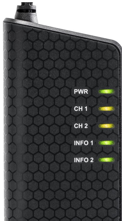
Figure 4: LEDs on the Kvaser Hybrid Pro 2xCAN/LIN.

The Kvaser Hybrid Pro 2xCAN/LIN has a single power LED as well as one traffic LED and one Informational LED for each CAN/LIN channel as shown in Figure 4 on Page 10. Their functions are described in Section 4.1, Definitions of LED states and colors, on Page 11.