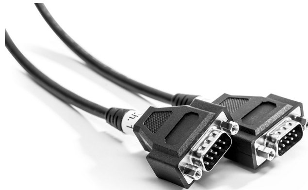
Figure 3: CAN/LIN connector on Kvaser Hybrid Pro 2xCAN/LIN

The Kvaser Hybrid Pro 2xCAN/LIN has two LIN/CAN Hi-Speed channels in two separate 9-pin D-SUB CAN connectors (see Figure 3). See Section 4.4, CAN/LIN connector, on Page 14 for pinout information.