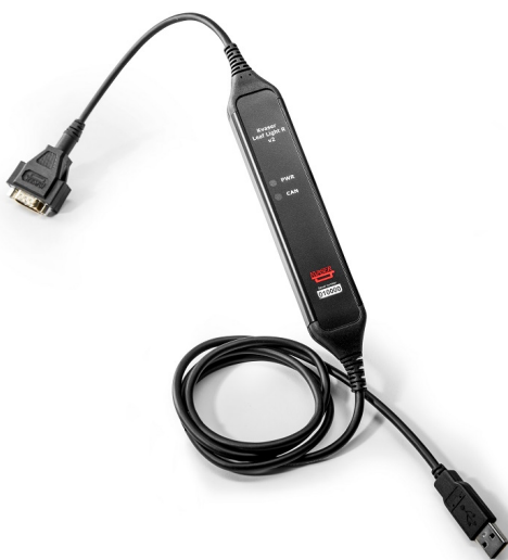
Figure 1: Kvaser Leaf Light R v2

Kvaser Leaf Light R v2 is a reliable low cost product. In hostile environments where dust and water are the norm, the IP65 rated housing assures reliable protection. With a time stamp precision of 100 microseconds it handles transmission and reception of standard and extended CAN messages on the bus. It is compatible with applications that use Kvaser's CANlib.