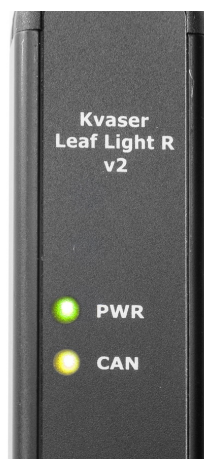
Figure 4: LEDs on the Kvaser Leaf Light R v2.

The Kvaser Leaf Light R v2 has two LEDs as shown in Figure 4. Their functions are shown in Table 2 on Page 9.