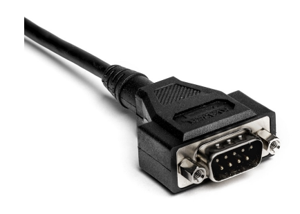
Figure 3: 9-pin D-SUB CAN connector

The Kvaser Leaf Light R v2 has one CAN Hi-Speed channel with a 9-pin D-SUB CAN connector. See Section 4.2, CAN connector, on Page 11 for details about the pinout.