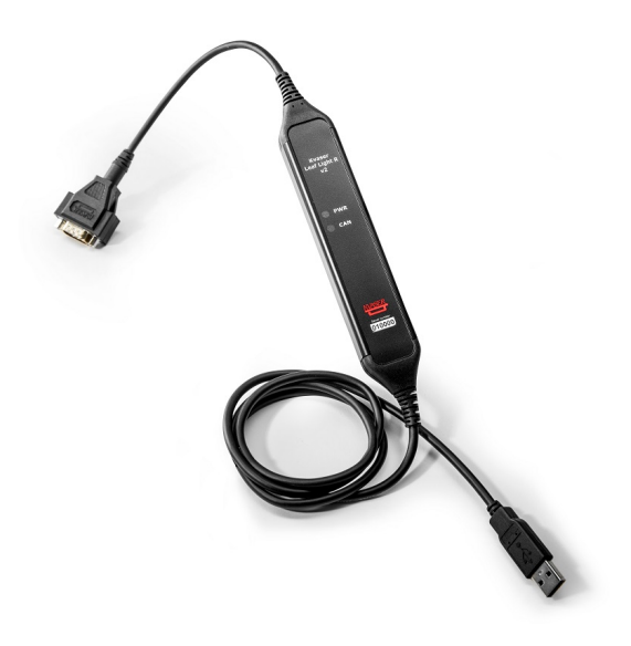
Figure 1: Kvaser Leaf Light R v2

Kvaser Leaf Light R v2 is a reliable low cost product. In hostile environments where dust and water are the norm, the IP65 rated housing assures reliable protection. With a time stamp precision of 100 microseconds it handles transmission and reception of standard and extended CAN messages on the bus. It is compatible with applications that use Kvaser's CANlib.