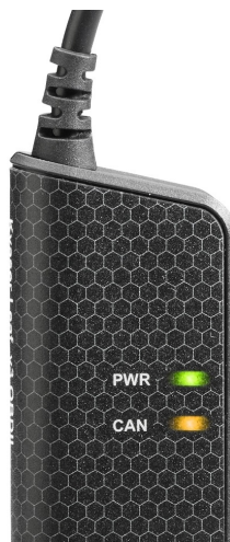
Figure 4: LEDs on the Kvaser Leaf v3 OBDII.

The Kvaser Leaf v3 OBDII has two LEDs as shown in Figure 4. Their functions are shown in Table 2 on Page 9.