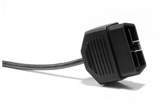
Figure 3: OBDII Type B CAN connector.