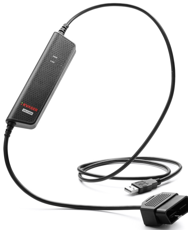
Figure 1: Kvaser Leaf v3 OBDII

Kvaser Leaf v3 OBDII is a reliable low cost product. With a timestamp precision of 50 microseconds it handles transmission and reception of standard and extended CAN messages on the bus. It is compatible with applications that use Kvaser's CANlib.