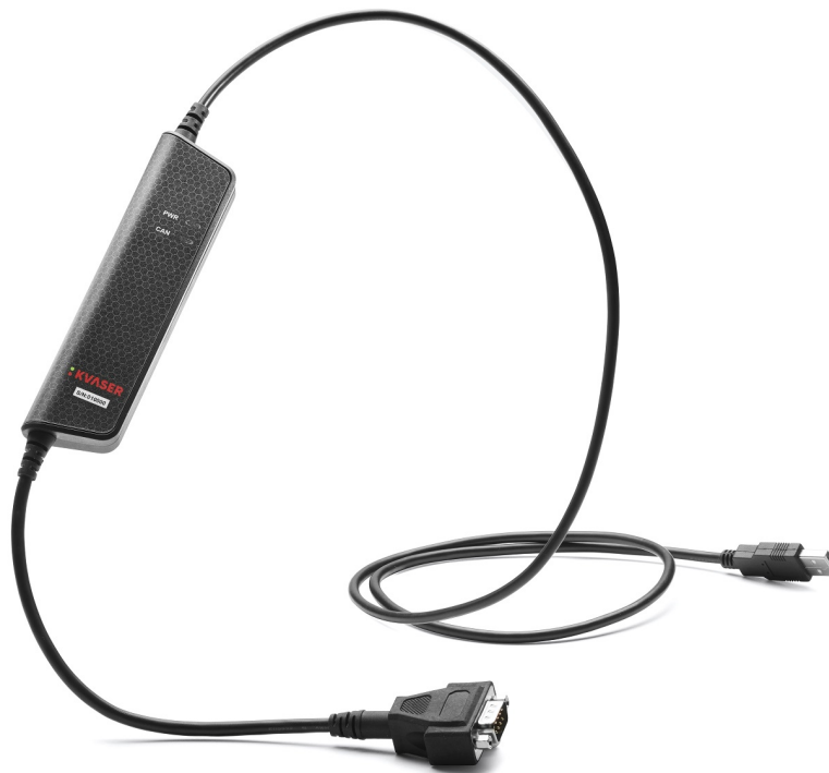
Figure 1: Kvaser Leaf v3

Kvaser Leaf v3 is a reliable low cost product. With a timestamp precision of 50 microseconds it handles transmission and reception of standard and extended CAN messages on the bus. It is compatible with applications that use Kvaser's CANlib.