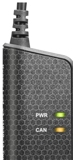
Figure 5: LEDs on the Kvaser Leaf v3.

The Kvaser Leaf v3 has two LEDs as shown in Figure 5. Their functions are shown in Table 3.