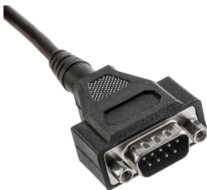
Figure 3: 9-pin D-SUB CAN connector.

The CAN connector for the Kvaser Leaf v3 is the 9-pin D-SUB connector (see Figure 3 on Page 8) which has the pinout described in Table 2 on Page 8.