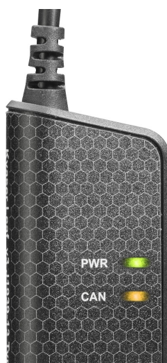
Figure 5: LEDs on the Kvaser Leaf v3.

The Kvaser Leaf v3 has two LEDs as shown in Figure 5. Their functions are shown in Table 3.