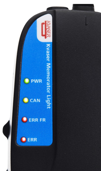
Figure 3: LEDs on the Kvaser Memorator Light HS v2.

The Kvaser Memorator Light HS v2 is equipped with four LED indicators. The following tables describe the status functions of the LEDs.