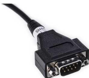
Figure 2: CAN connector on Kvaser Memorator Light HS v2