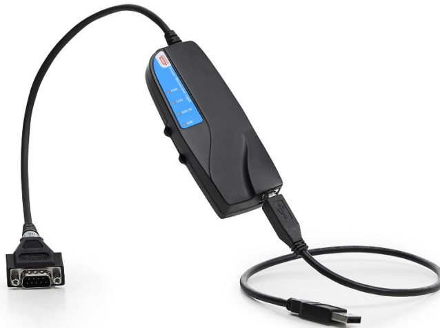
Figure 1: Kvaser Memorator Light HS v2

The Kvaser Memorator Light HS v2 is an advanced portable CAN data logger. The device features two CAN message buffers that are used as ring (FIFO) buffers. One buffer logs all messages on the bus. The other buffer logs approximately 1000 messages before and 1000 messages after any error frame.