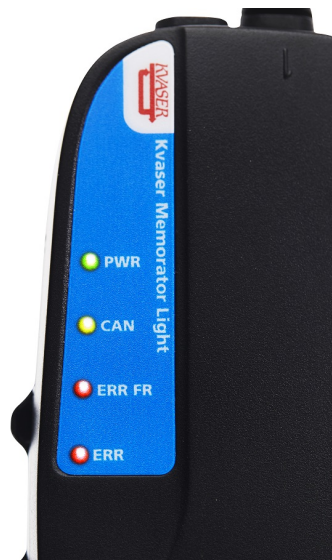
Figure 3: LEDs on the Kvaser Memorator Light HS v2.

The Kvaser Memorator Light HS v2 is equipped with four LED indicators. The following tables describe the status functions of the LEDs.