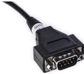
Figure 2: CAN connector on Kvaser Memorator Light HS v2