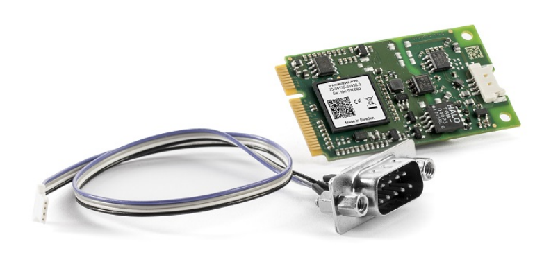
Figure 1: Kvaser Mini PCI Express HS v2

Kvaser Mini PCI Express HS v2 is a small, yet advanced, real time CAN interface that handles transmission and reception of standard and extended CAN messages on the bus with a high time stamp precision. The Kvaser Mini PCI Express HS v2 is compatible with applications that use Kvaser's CANlib.