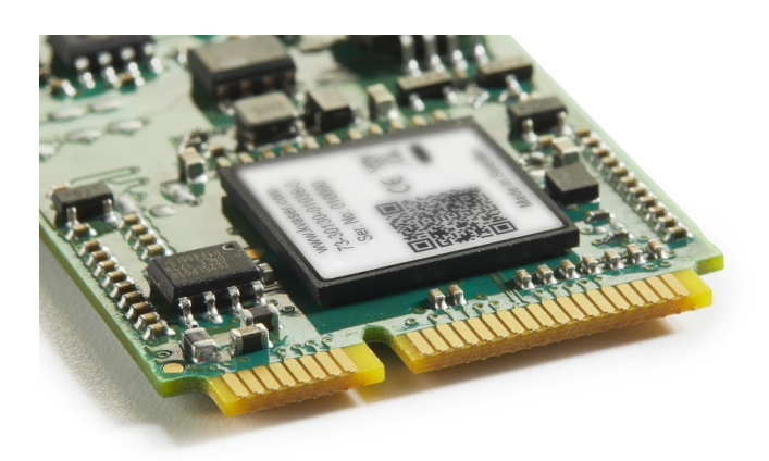
Figure 2: Mini PCI Express connector

The Kvaser Mini PCI Express HS v2 is a Card of type F2 (Full-Mini with bottom side keep outs).