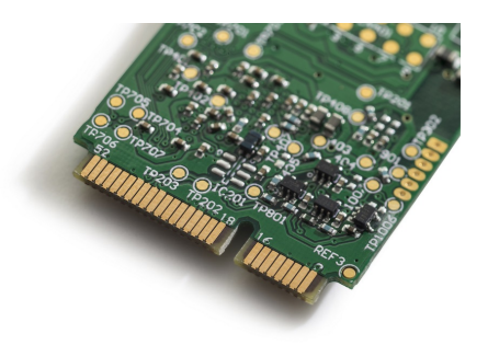
Figure 2: Kvaser Mini PCI Express

The Kvaser Mini PCI Express is a Card of type F2 (Full-Mini with bottom side keep outs).