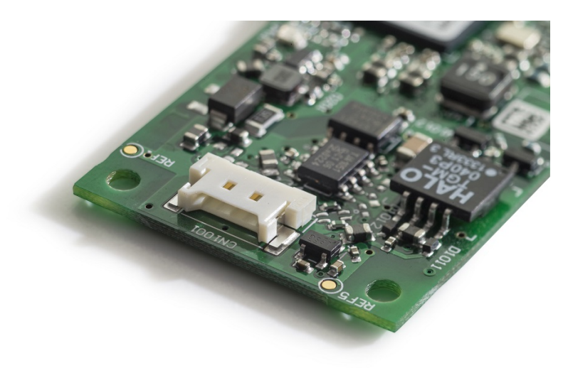
Figure 3: CAN connector on Kvaser Mini PCI Express HS

The Kvaser Mini PCI Express HS has one CAN channel and has a 4-pin Molex connector (see Figure 3 on Page 8), the Kvaser Mini PCI Express 2xHS has two CAN channels and a 7-pin Molex connector (see Figure 4 on Page 8). See Section 5.2, CAN connectors, on Page 11 for pinout information.