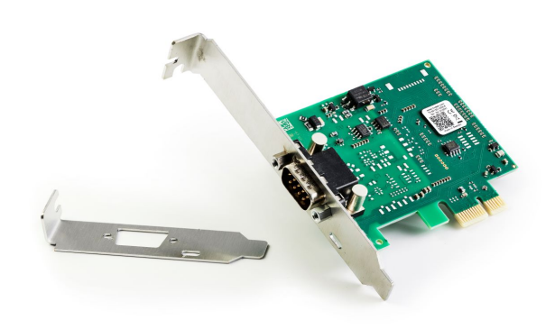
Figure 1: Kvaser PCIEcan 1xCAN v3

Kvaser PCIEcan 1xCAN v3 is a small, yet advanced, real time CAN interface that handles transmission and reception of standard and extended CAN messages on the bus with a high time stamp precision. The Kvaser PCIEcan 1xCAN v3 is compatible with applications that use Kvaser's CANlib.