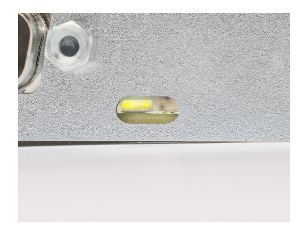
Figure 3: LED on the Kvaser PCIEcan 1xCAN v3.