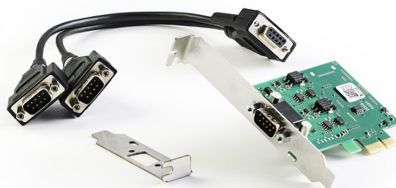
Figure 1: Kvaser PCIEcan 2xCAN v3

Kvaser PCIEcan 2xCAN v3 is a small, yet advanced, CAN multi-channel real time CAN interface that handles transmission and reception of standard and extended CAN messages on the bus with a high time stamp precision. The Kvaser PCIEcan 2xCAN v3 is compatible with applications that use Kvaser's CANlib.