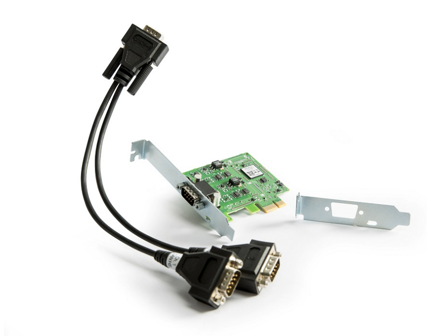
Figure 1: Kvaser PCIEcan 2xHS v2

Kvaser PCIEcan 2xHS v2 is a small, yet advanced, CAN multi-channel real time CAN interface that handles transmission and reception of standard and extended CAN messages on the bus with a high time stamp precision. The Kvaser PCIEcan 2xHS v2 is compatible with applications that use Kvaser's CANlib.