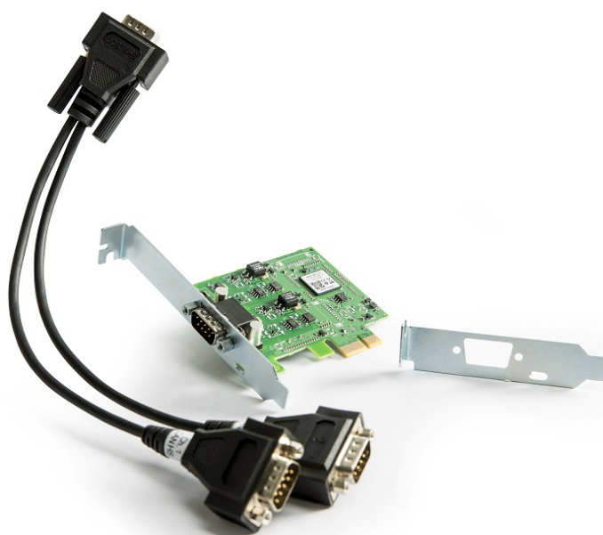
Figure 1: Kvaser PCIEcan 2xHS v2

Kvaser PCIEcan 2xHS v2 is a small, yet advanced, CAN multi-channel real time CAN interface that handles transmission and reception of standard and extended CAN messages on the bus with a high time stamp precision. The Kvaser PCIEcan 2xHS v2 is compatible with applications that use Kvaser's CANlib.