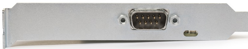
Figure 2: CAN connector on Kvaser PCIEcan 2xHS v2

The Kvaser PCIEcan 2xHS v2 has two CAN channels in a single 9-pin male D-SUB CAN connector (see Figure 2). See Section 4.2, CAN connectors, on Page 9 for pinout information.