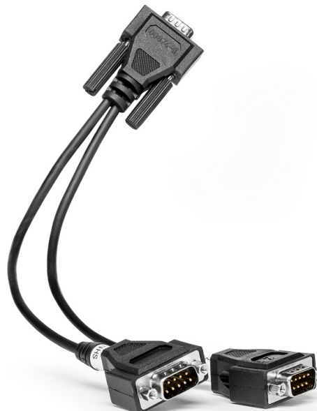
Figure 5: The DS9-2xDS9 Splitter