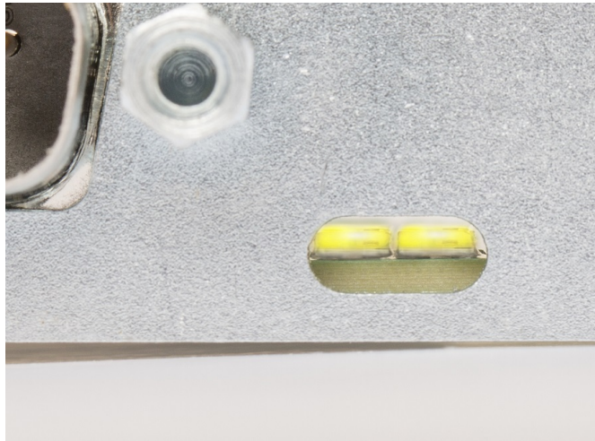
Figure 3: LEDs on the Kvaser PCIEcan 2xHS v2.