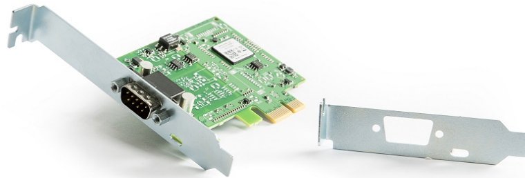
Figure 1: Kvaser PCIEcan HS v2

Kvaser PCIEcan HS v2 is a small, yet advanced, real time CAN interface that handles transmission and reception of standard and extended CAN messages on the bus with a high time stamp precision. The Kvaser PCIEcan HS v2 is compatible with applications that use Kvaser's CANlib.