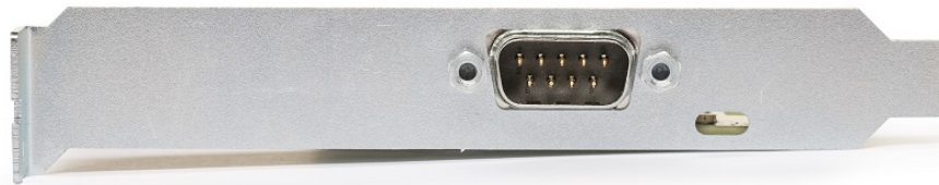
Figure 2: CAN connector on Kvaser PCIEcan HS v2

The Kvaser PCIEcan HS v2 has a single CAN channel with a 9-pin male D-SUB CAN connector (see Figure 2). See Section 4.2, CAN connectors, on Page 9 for pinout information.