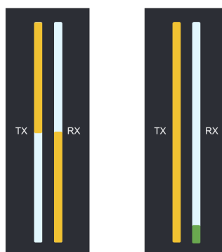
Figure 7: The yellow-lit area of the LED bars is proportional to the bus load. Both images indicate a bus load of 100%.

at 50% bus load. Figure 7 on Page 12 shows two different bus load conditions. The image on the left shows the unit transmitting and receiving data corresponding to 50% bus load in each direction for a total of 100% bus load. The image on the right shows the unit transmitting data corresponding to 100% bus load.