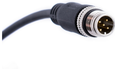
Figure 3: M12 5-pole CAN connector.

The CAN connector for the Kvaser U100-X2 is the 5-pole M12 plug (see Figure 3) which has the pinning described in Table 2 on Page 9.