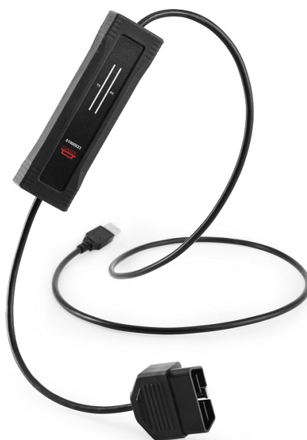
Figure 1: Kvaser U100P-X3

Kvaser U100P-X3 is a small, yet powerful, CAN to USB interface. It provides real-time transmission and reception of standard and extended CAN messages on the bus with a high timestamp precision, and is compatible with applications that use Kvaser's CANlib.