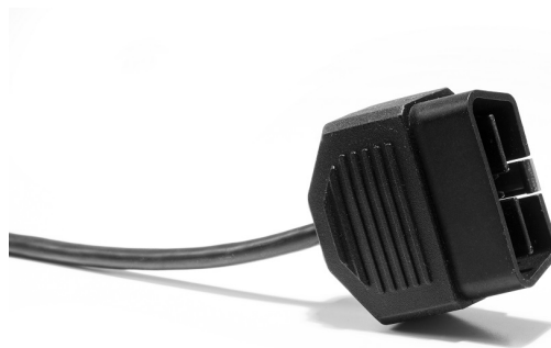
Figure 5: OBDII Type B CAN connector.

The CAN connector for the Kvaser U100P-X3 is the 16-pin OBDII Type B plug which has the pinning described in Table 2.