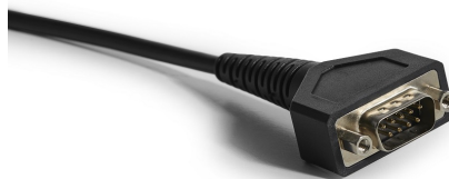
Figure 5: The 9-pin D-SUB CAN connector.

The CAN connector for the Kvaser U100P is the 9-pin D-SUB connector (see Figure 5) which has the pinout described in Table 2 on Page 10.