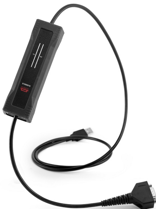
Figure 1: Kvaser U100P

Kvaser U100P is a small, yet powerful, CAN to USB interface. It provides real-time transmission and reception of standard and extended CAN messages on the bus with a high timestamp precision, and is compatible with applications that use Kvaser's CANlib.