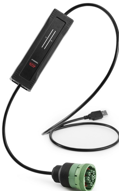
Figure 1: Kvaser U100S-X1

Kvaser U100S-X1 is a small, yet powerful, CAN to USB interface. It provides real-time transmission and reception of standard and extended CAN messages on the bus with a high timestamp precision, and is compatible with applications that use Kvaser's CANlib.