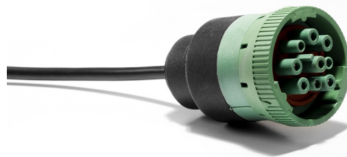
Figure 5: J1939-13 Type II CAN connector.

The CAN connector for the Kvaser U100S-X1 is the 9-pin J1939-13 Type II connector (see Figure 5) which has the pinning described in Table 2 on Page 10.