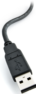
Figure 2: A standard USB type “A” connector.

The USB connector for the Kvaser U100S-X2 is a standard USB type “A” connector (see Figure 2).