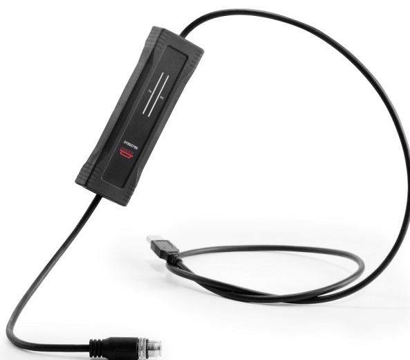
Figure 1: Kvaser U100S-X2

Kvaser U100S-X2 is a small, yet powerful, CAN to USB interface. It provides real-time transmission and reception of standard and extended CAN messages on the bus with a high timestamp precision, and is compatible with applications that use Kvaser's CANlib.