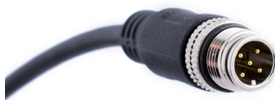
Figure 5: M12 5-pole CAN connector.

The CAN connector for the Kvaser U100S-X2 is the 5-pole M12 plug (see Figure 5) which has the pinning described in Table 2.