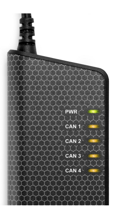
Figure 4: LEDs on the Kvaser USBcan Light 4xHS.