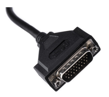
Figure 3: CAN connector on Kvaser USBcan Light 4xHS

The Kvaser USBcan Light 4xHS has four CAN Hi-Speed channels in a single 26-pin HD D-SUB CAN connector (see Figure 3). See Section 4.3, CAN connectors, on Page 12 for pinout information.