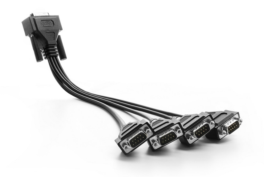
Figure 7: The HD26-4xDS9 Splitter