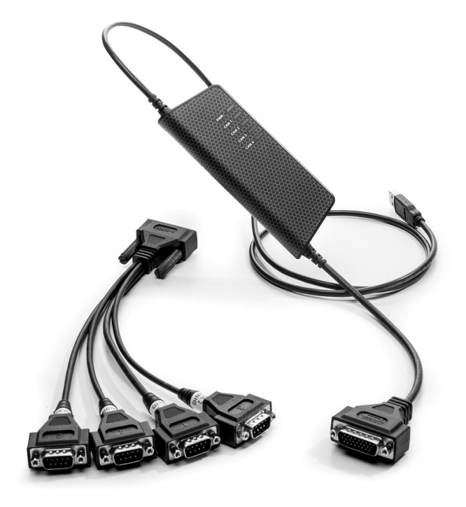
Figure 1: Kvaser USBcan Light 4xHS

Kvaser USBcan Light 4xHS is a small, yet advanced, portable multi channel CAN to USB real time interface that handles transmission and reception of standard and extended CAN messages on the CAN bus with a high time stamp precision. The Kvaser USBcan Light 4xHS is compatible with applications that use Kvaser's CANlib.