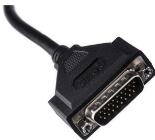
Figure 3: CAN connector on Kvaser USBcan Light 4xHS

The Kvaser USBcan Light 4xHS has four CAN Hi-Speed channels in a single 26-pin HD D-SUB CAN connector (see Figure 3). See Section 4.3, CAN connectors, on Page 12 for pinout information.