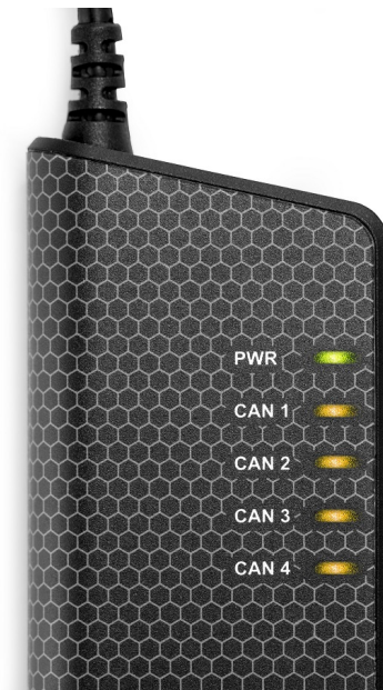
Figure 4: LEDs on the Kvaser USBcan Light 4xHS.