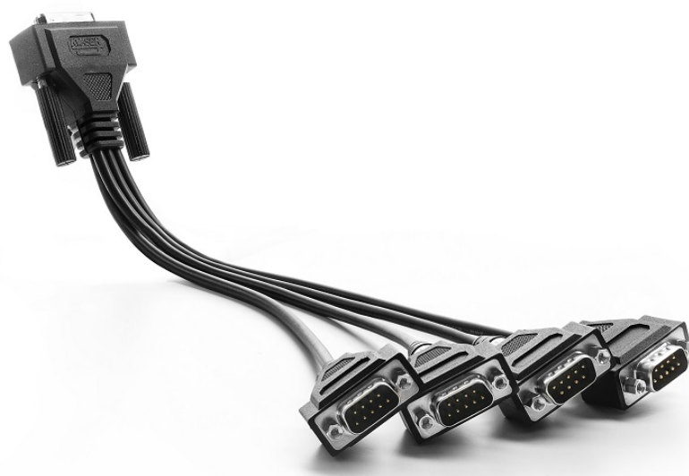
Figure 7: The HD26-4xDS9 Splitter