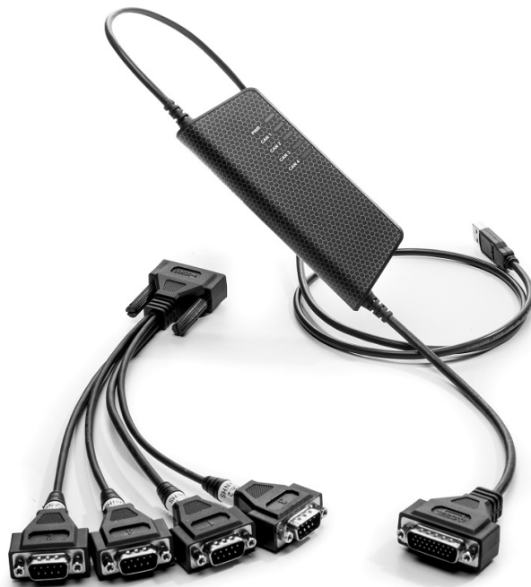
Figure 1: Kvaser USBcan Light 4xHS

Kvaser USBcan Light 4xHS is a small, yet advanced, portable multi channel CAN to USB real time interface that handles transmission and reception of standard and extended CAN messages on the CAN bus with a high time stamp precision. The Kvaser USBcan Light 4xHS is compatible with applications that use Kvaser's CANlib.