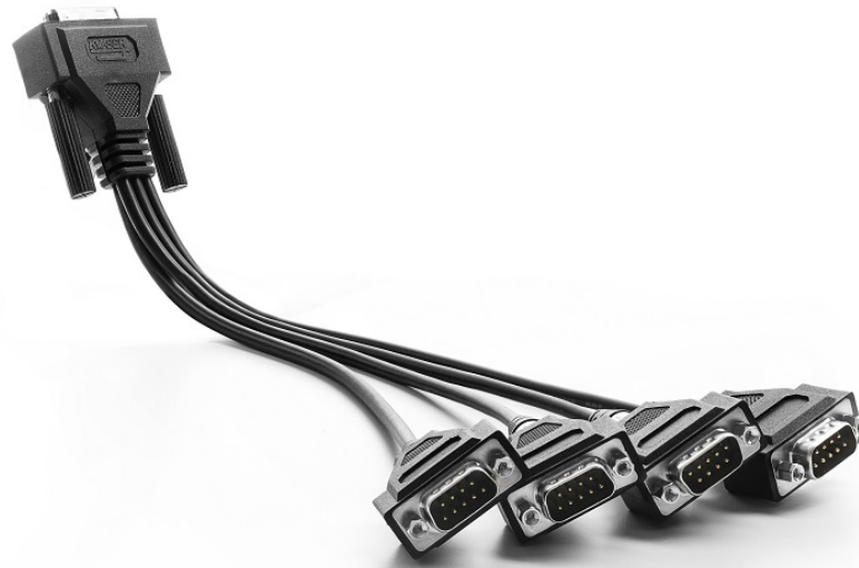
Figure 7: The HD26-4xDS9 Splitter