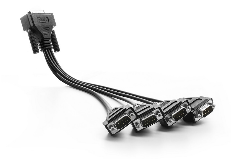
Figure 7: The HD26-4xDS9 Splitter