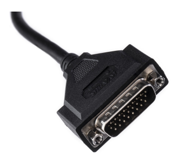
Figure 3: CAN connector on Kvaser USBcan Light 4xHS

The Kvaser USBcan Light 4xHS has four CAN Hi-Speed channels in a single 26-pin HD D-SUB CAN connector (see Figure 3 on Page 8). See Section 4.3, CAN connectors, on Page 12 for pinout information.