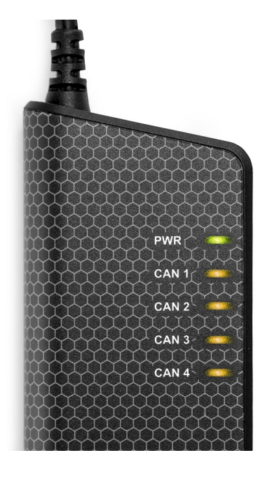
Figure 4: LEDs on the Kvaser USBcan Light 4xHS.

The Kvaser USBcan Light 4xHS has one power LED and one traffic LED for each CAN channel as shown in Figure 4. Their functions are described in Section 4.1, Definitions of LED states and colors, on Page 10.