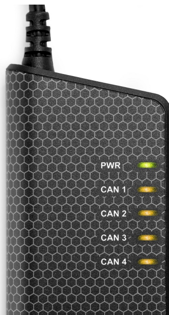
Figure 4: LEDs on the Kvaser USBcan Light 4xHS.

The Kvaser USBcan Light 4xHS has one power LED and one traffic LED for each CAN channel as shown in Figure 4. Their functions are described in Section 4.1, Definitions of LED states and colors, on Page 10.