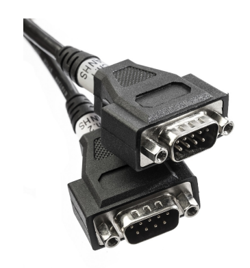
Figure 2: CAN connectors on Kvaser USBcan Light 2xHS