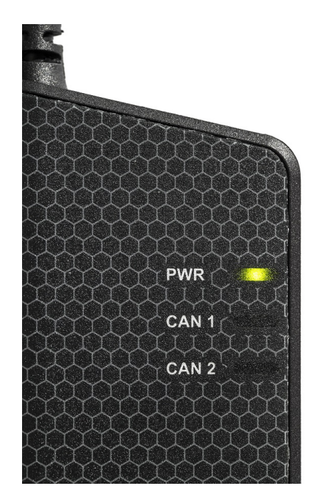
Figure 3: LEDs on the Kvaser USBcan Light.

The Kvaser USBcan Light has three LEDs as shown in Figure 3. Their functions are shown in Table 2 on Page 10.