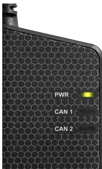
Figure 3: LEDs on the Kvaser USBcan Light.

The Kvaser USBcan Light has three LEDs as shown in Figure 3. Their functions are shown in Table 2.