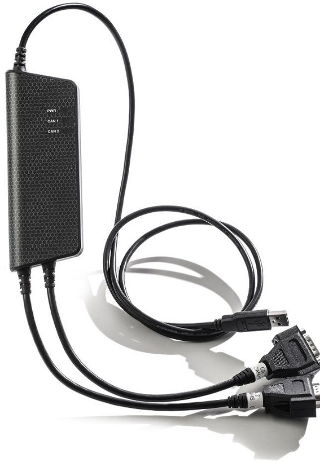
Figure 1: Kvaser USBcan Light

Kvaser USBcan Light is a reliable low cost product. With a time stamp precision of 100 microseconds it handles transmission and reception of standard and extended CAN messages on the bus. It is compatible with applications that use Kvaser's CANlib.