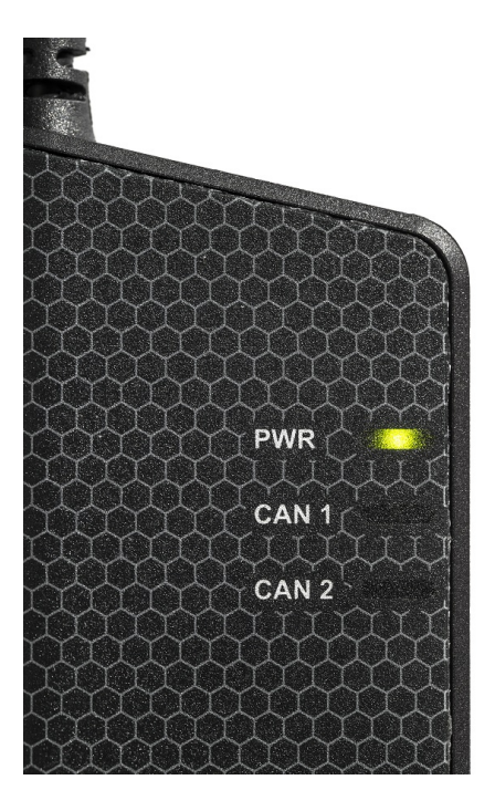
Figure 3: LEDs on the Kvaser USBcan Light.

The Kvaser USBcan Light has three LEDs as shown in Figure 3. Their functions are shown in Table 2.