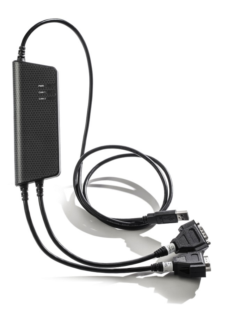
Figure 1: Kvaser USBcan Light

Kvaser USBcan Light is a reliable low cost product. With a time stamp precision of 100 microseconds it handles transmission and reception of standard and extended CAN messages on the bus. It is compatible with applications that use Kvaser's CANlib.