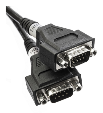
Figure 2: CAN connectors on Kvaser USBcan Light 2xHS

The Kvaser USBcan Light has two CAN Hi-Speed channels with 9-pin D-SUB CAN connectors (see Figure 2). See Section 4.2, CAN connectors, on Page 9 for pinout information.