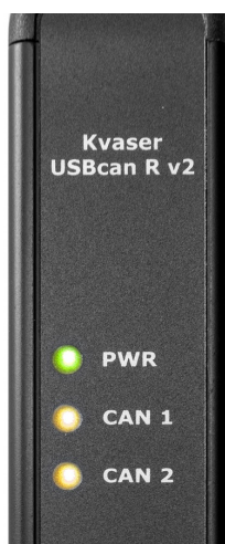
Figure 4: LEDs on the Kvaser USBcan R v2.

The Kvaser USBcan R v2 has three LEDs as shown in Figure 4. Their functions are shown in Table 2 on Page 9.