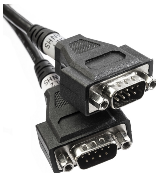
Figure 3: CAN connectors on Kvaser USBcan R v2 2xHS

The Kvaser USBcan R v2 has two CAN Hi-Speed channels with 9-pin D-SUB CAN connectors (see Figure 3 on Page 8). See Section 4.2, CAN connectors, on Page 10 for pinout information.